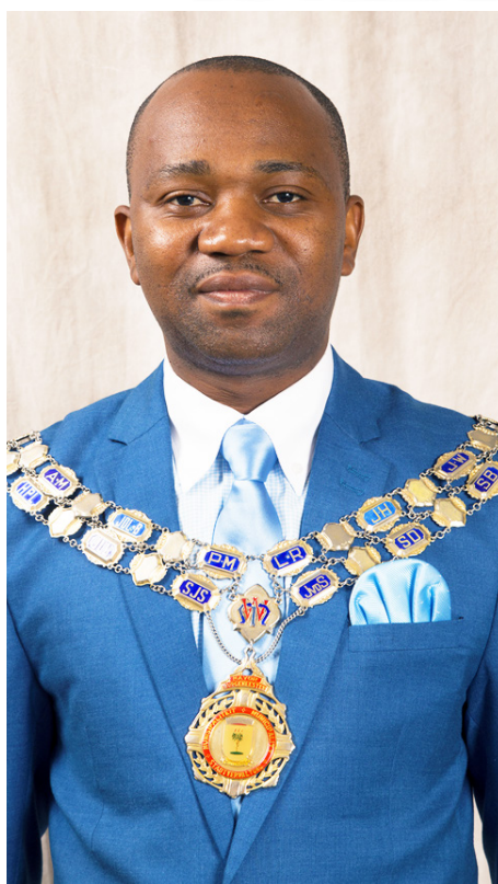
His Worship, Councillor Muesee Kazapua, City of Windhoek Mayor

The City of Windhoek is committed towards formalising the informal settlements. This was announced by His Worship, Councillor Muesee Kazapua, City of Windhoek Mayor during the Council 2nd ordinary meeting on 27 February 2017.